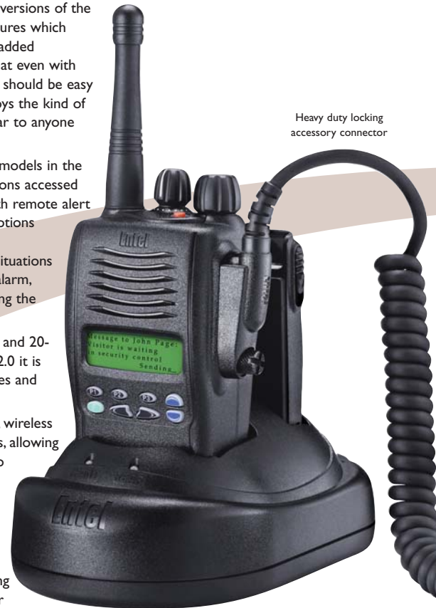
Heavy duty locking accessory connector

Location Information (option) – whether for convenience or security, all MPT1327 radios in the HX Series 2.0 offer Bluetooth indoor beacon positioning and outdoor GPS positioning options, for pinpointing the exact location of a user or navigating emergency assistance to the site of a disturbance or casualty.